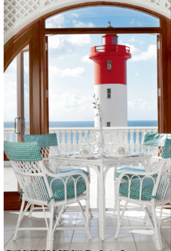
THIS PICTURE & BELOW: The Oyster Box

Down the road at the eight-roomed Teremok Marine Hotel, you pay approximately half these rates, but still get loads of luxury and space (as well