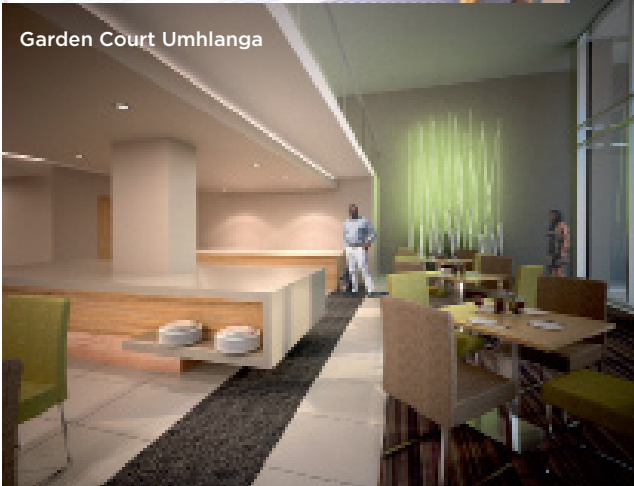
Garden Court Umhlanga

The hotel's restaurant, Mnandi, offers delicious a la carte options, while the Afro Fusion Action Bar has a comprehensive tapas menu. In addition, private functions are well catered for in the beautifully decked-out meeting rooms. D