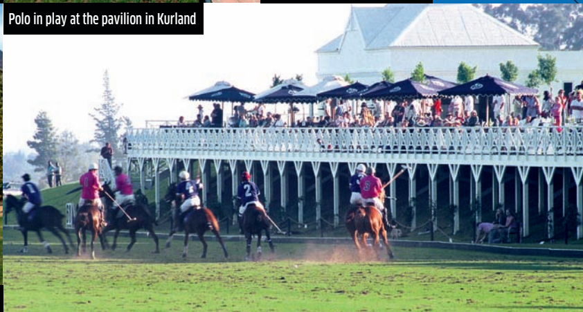
Polo in play at the pavilion in Kurland

at five-star Kurland hotel are also top notch (0027-44-534 8082; kurland.co.za ). The Grand Café & Rooms in Plettenberg Bay is perfect for lovebirds – book the suite with two baths side by side (0027-44-533 3301; thegrand.co.za ). Pack a picnic lunch – don't forget the BBQ meat – and hire a boat at the nearby Keurbooms River Ferries (0027-44-532 7876; ferry.co.za ).