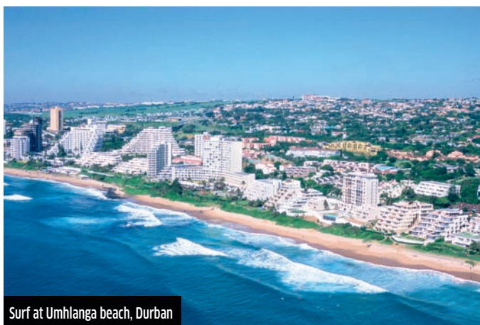
Surf at Umhlanga beach, Durban

be sure to order a breakfast of kedgerie (smoked had-dock with yellow rice) for a throwback to the British Raj. For sophisticated luxury, the newly revamped Oyster Box (0027-31-514 5000; oysterboxhotel.com ) is a winner. Don't be surprised if it tops Durban's best hotel list this year with its nautical-meets-colonial decor. The elements café bar at the adjacent Beverly Hills Hotel (0027-31-561 2211; southernsun.com ) is considered one of the hot spots to see and be seen. Order their bunny chow (hollowed out →