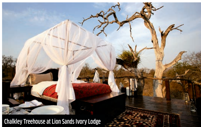
Chalkley Treehouse at Lion Sands Ivory Lodge