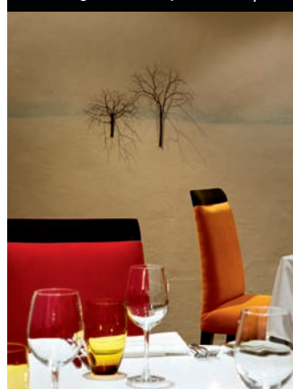
The Tasting Room at Le Quartier Français