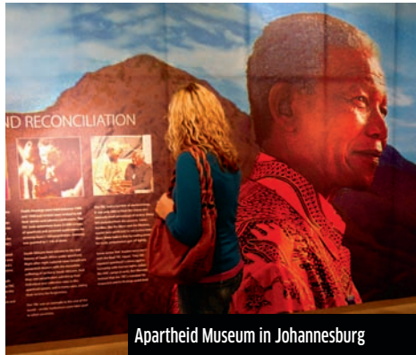
Apartheid Museum in Johannesburg

bread filled with curry) for a twist on local street food. End your night at Clapham Grand ( claphamgrand.co.za ), sipping a cocktail while overlooking the packed dance floor.