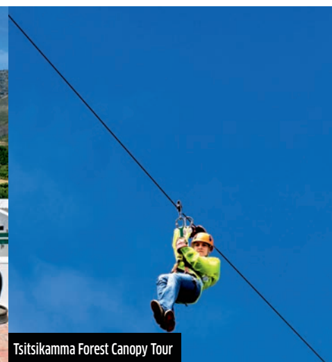
Tsitsikamma Forest Canopy Tour