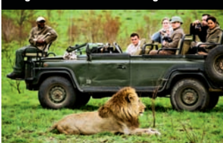
Kruger Park is home to the Big Five

a tree. Inclusive game walks bring you up close – keep an eye out for banded mongooses or a large troupe of vervet monkeys.