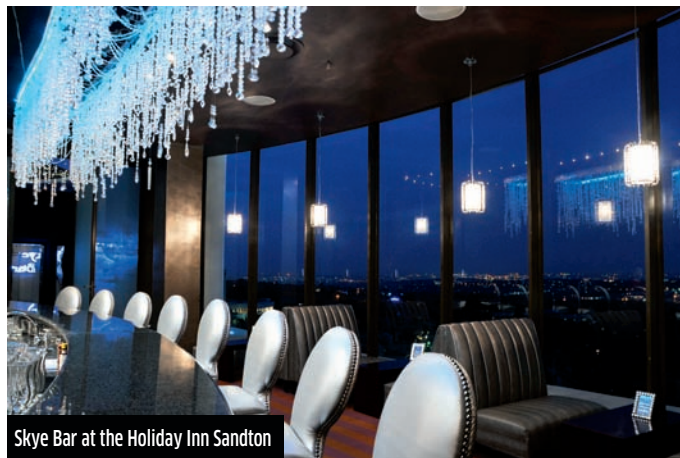
Skye Bar at the Holiday Inn Sandton

Take a day trip to uShaka Marine World (0027-31-328 8000; ushakamarineworld.co.za ) and Beach to ogle at the giant sharks before heading into a protected bay for a swim. While all beaches in South Africa are