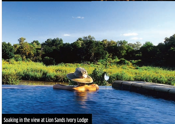
Soaking in the view at Lion Sands Ivory Lodge