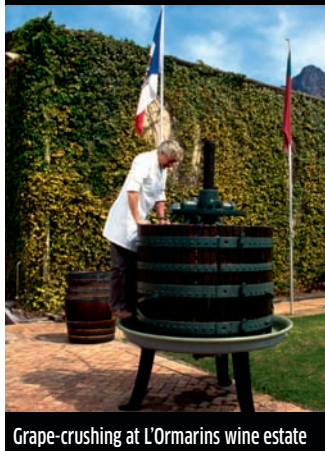
Grape-crushing at L'Ormarins wine estate