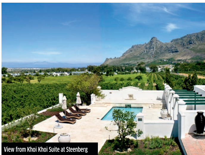
View from Khoi Khoi Suite at Steenberg

If you prefer equestrian sports, Kurland, Plettenberg Bay, is South Africa's polo capital. Kurland International Day, in December, is considered one of the top 10 polo matches in the world. It's only fitting for the sport of kings that dining and accommodation